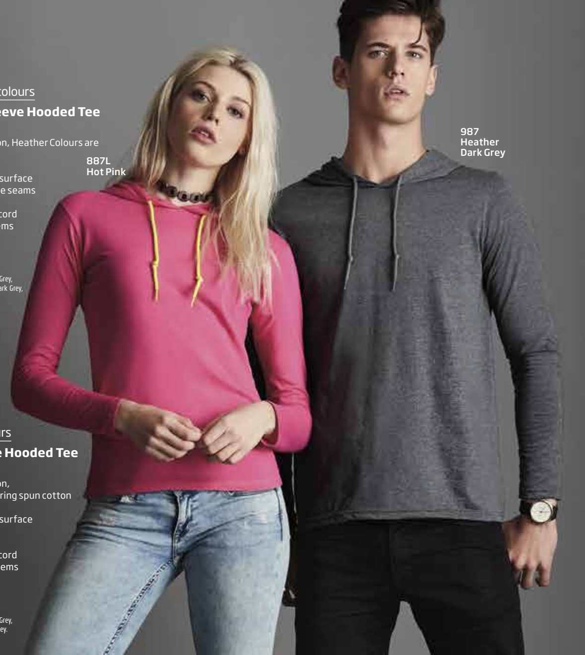
887L Hot Pink