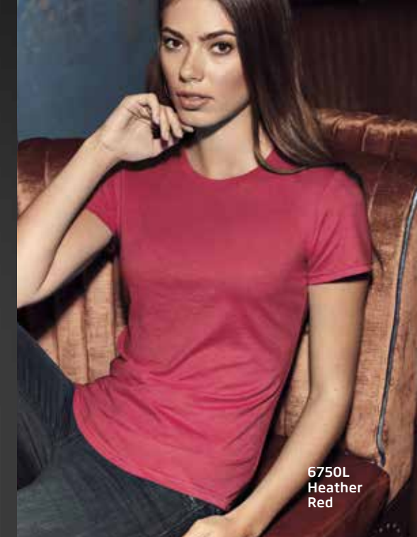
6750L Heather Red

6750L-NEW! | Semi-fitted | LXS - 2XL | 6 colours