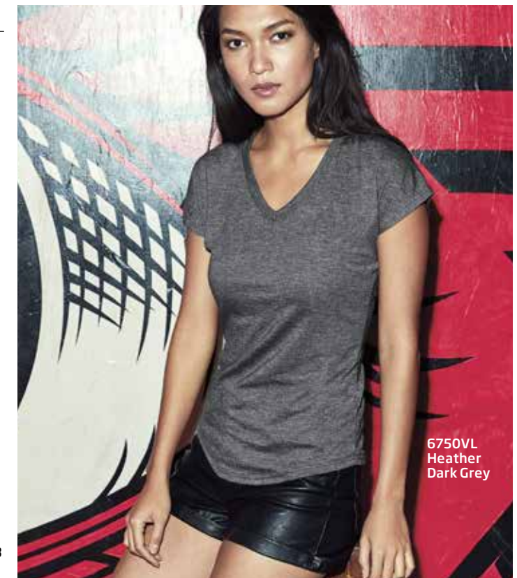
6750VL Heather Dark Grey

*RSC = % Ring Spun Cotton, R = % Rayon, P = % Polyester