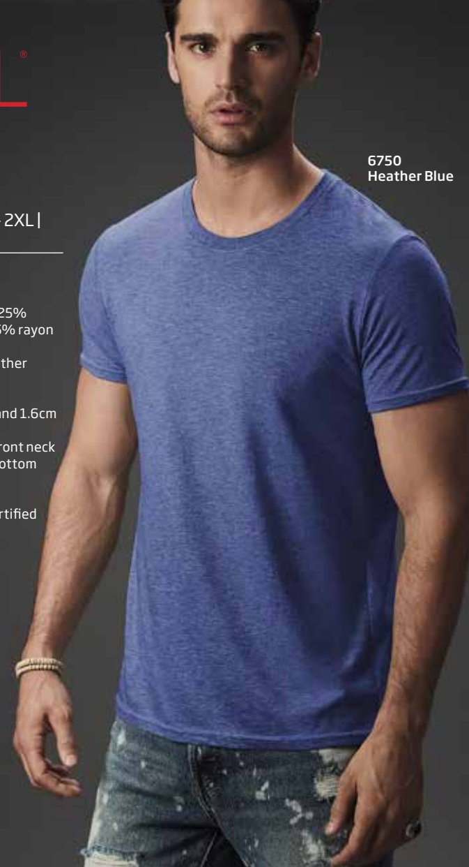
6750 Heather Blue

AVAILABLE COLOURS: Black, Heather Blue, Heather Dark Grey, Heather Purple, Heather Red, White.