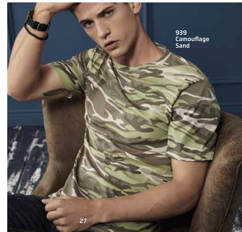
939 Camouflage Sand