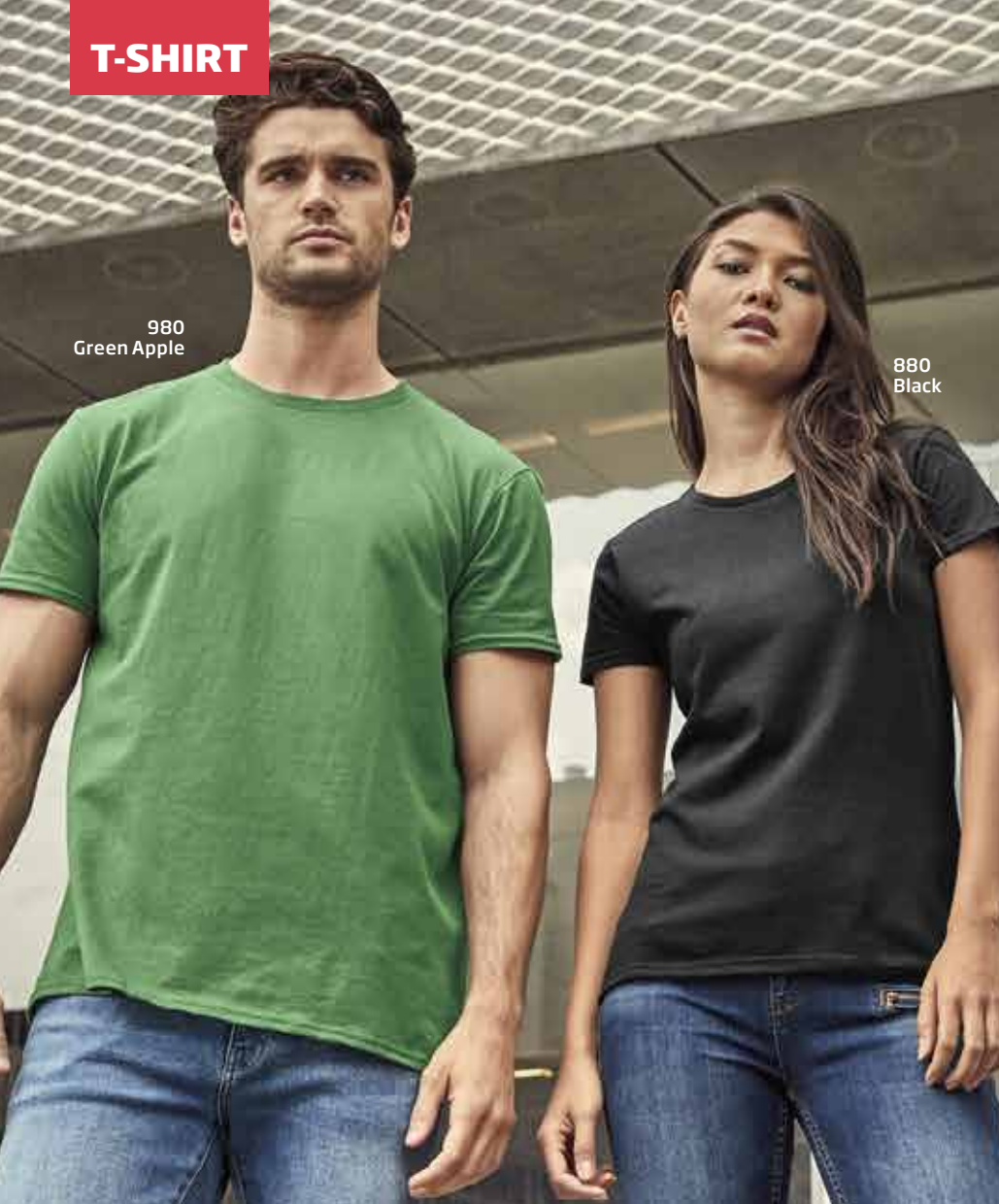
980 Green Apple